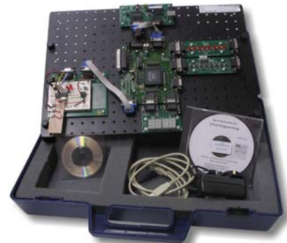
The FPGA solution