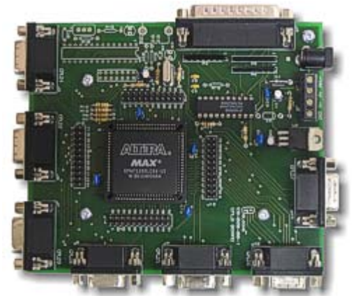
The FPGA board fits on top of the CPLD programming board – like this: